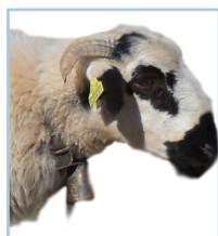
Ovino y Caprino