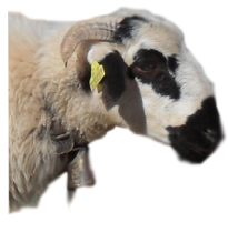
Ovino y Caprino