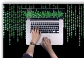
PROCESAMIENTO DE DATOS