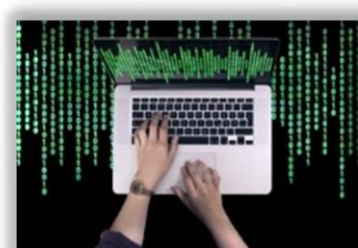
PROCESAMIENTO DE DATOS