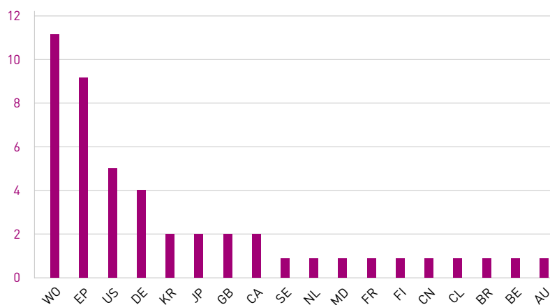
Figura 1. Distribución del número de solicitudes por ámbito de protección

En la Figura 2 se muestra la distribución del número de familias de patente por sus códigos CPC (Cooperative Patent Classification) más representativos relacionados con el proceso de síntesis de hidrógeno. Su significado se recoge en la Tabla 2. Cabe destacar que la mayoría se dirigen al proceso de gasificación de biomasa, aunque existen algunos relativos al proceso de fermentación oscura (C12M41/32) o al de pirólisis (C10B53/02).